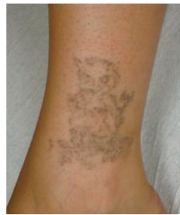
After 1 Treatment